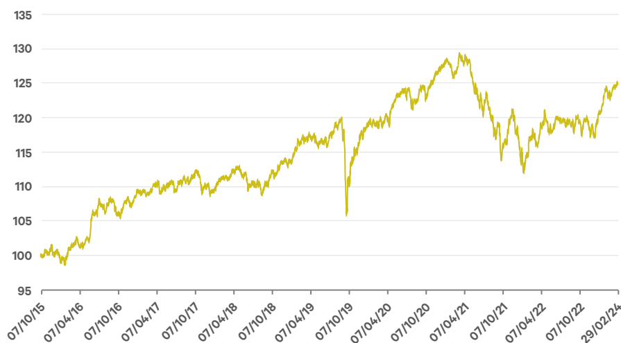
Figure 1: Performance of Davy UK GPS Cautious Growth Fund at 29 th February 2024

Warning: Past Performance is not a reliable guide to future performance. The value of your investment may go down as well as up. This product may be affected by changes in currency exchange rates.