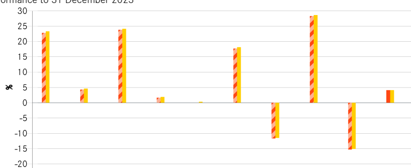
Historic performance to 31 December 2023

As of 31 December 2014, the Benchmark Index converted from a close of business valuation to a midday valuation. Historic performance of the Benchmark has been simulated by the Benchmark provider and such data is used for the purposes of demonstrating historic performance in the "Past Performance" table from 31 July 2009 or from the launch of the share class if later.