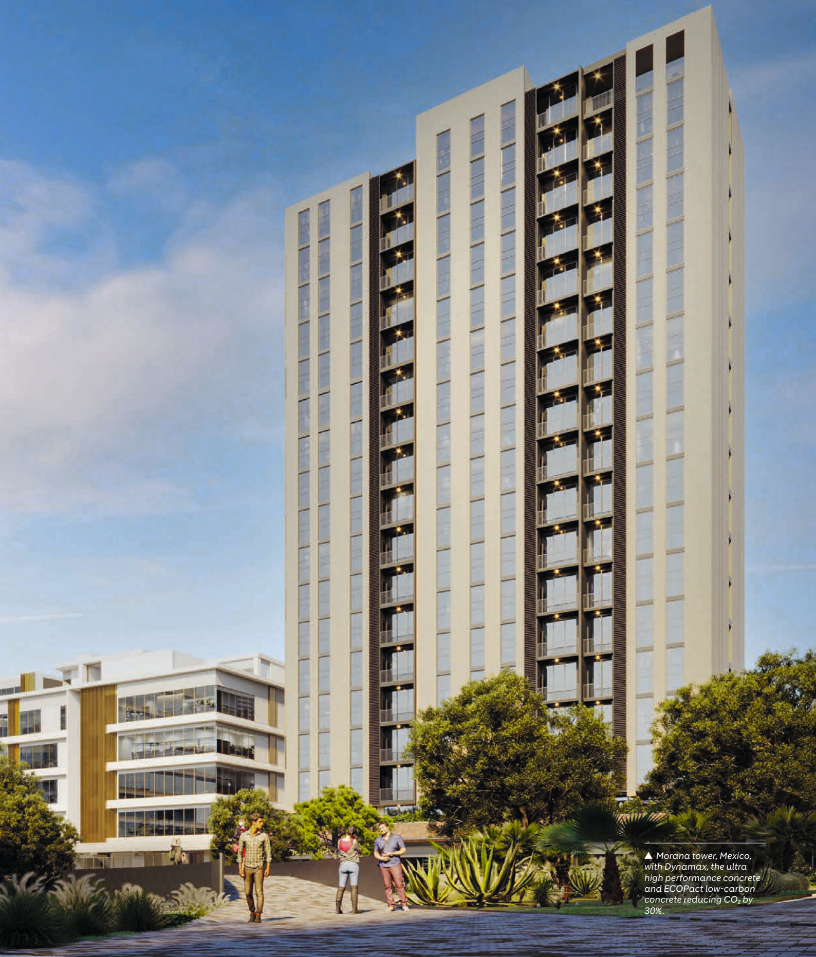
▲ Morana tower, Mexico, with Dynamax, the ultra high performance concrete and ECOPact low-carbon concrete reducing CO 2 by 30%.