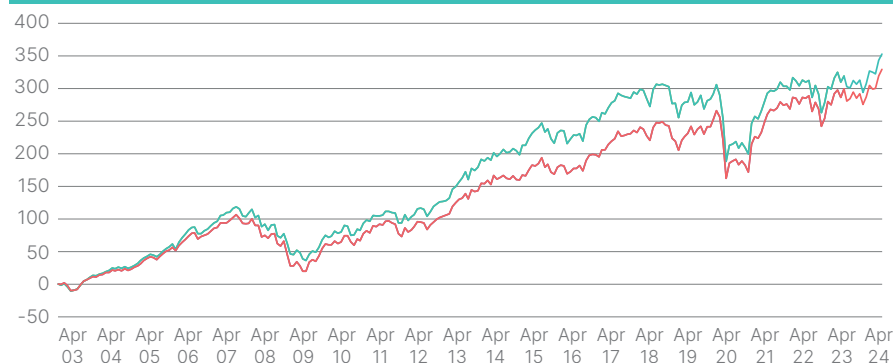
● Fund +352.5% ● Benchmark** +329.3%

Past performance is not a guide to future returns.