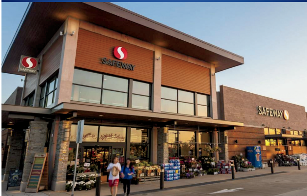
Grand Ridge Plaza | Issaquah, WA