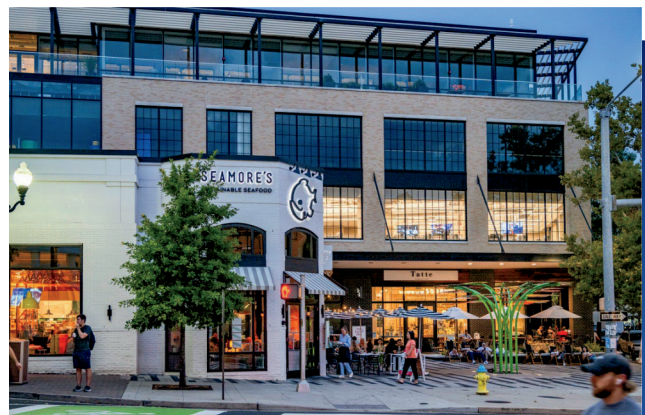
The Crossing Clarendon | Arlington, VA