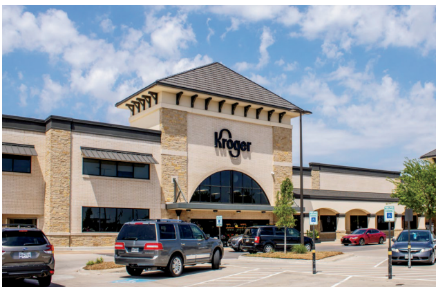
The Village at Riverstone | Sugar Land, TX

3.8% Dividend CAGR (compound annual growth rate) since 2014