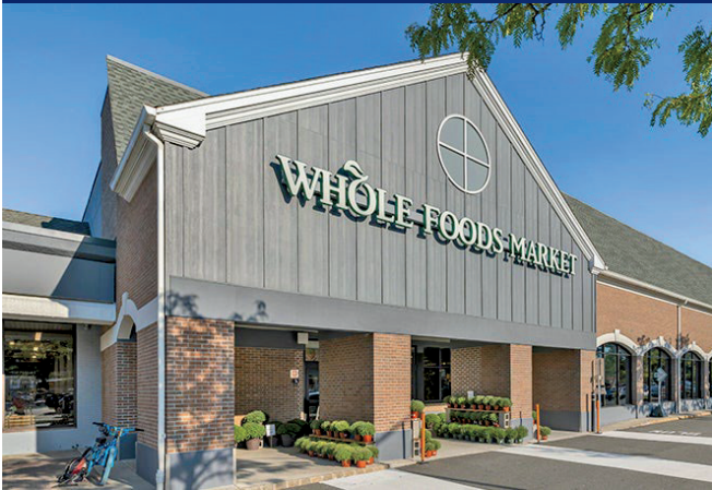
Valley Ridge Shopping Center | Wayne, NJ