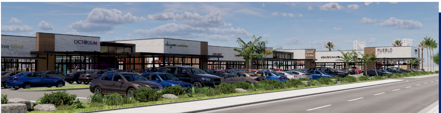
Avenida Biscayne | Aventura, FL

In-Process Projects at Year- end at Yields of ~8% and nearly 90% Leased