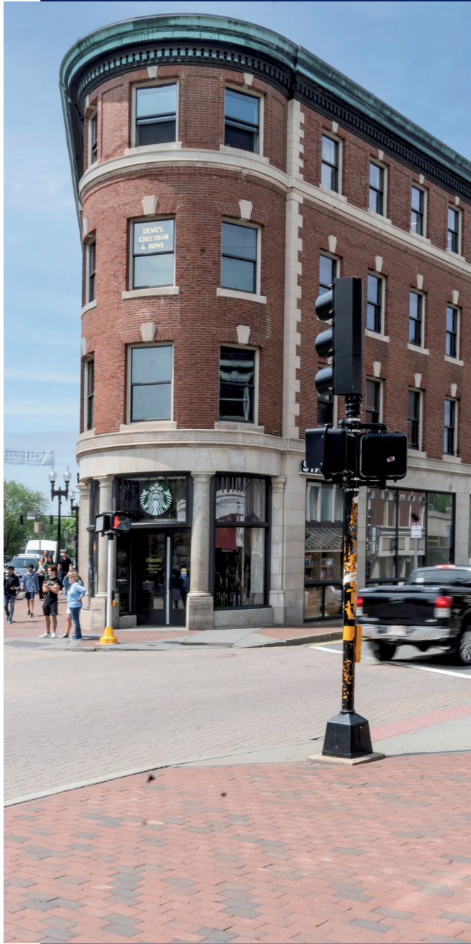
The Abbot | Cambridge, MA