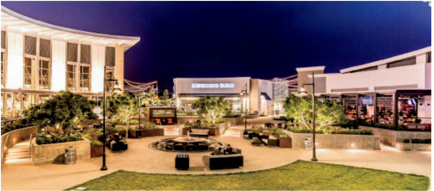
Village at La Floresta | Los Angeles, CA

Lastly, but importantly, Regency's success and accomplishments in 2023, and over the last 60 years, would not have been possible without the unwavering support of all our stakeholders. We are grateful for the continued commitment and engagement that our investors, tenants, joint venture partners, service providers, communities, Board of Directors and talented team have provided us over the last 60 years. We thank you for your loyalty and look forward to sharing many more years of success together.