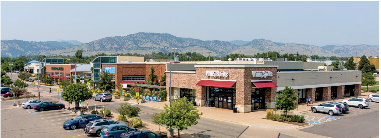
Crossroads Commons | Boulder, CO