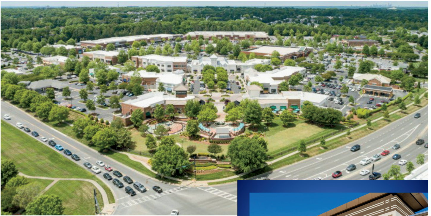
Blakeney Town Center | Charlotte, NC