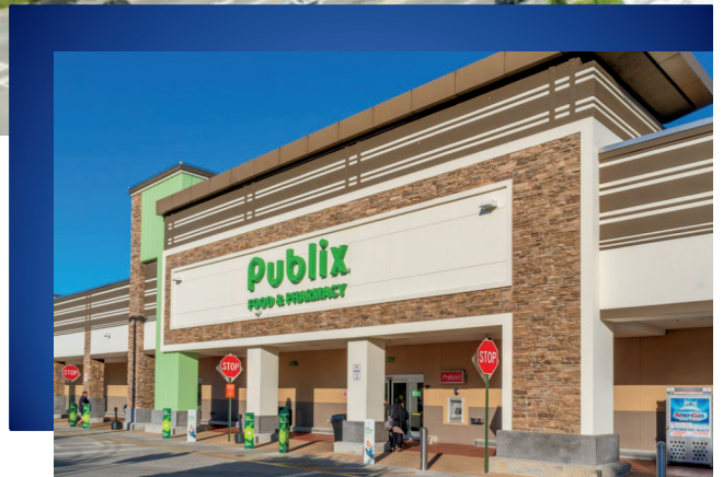
Countryside Shops | Ft. Lauderdale, FL

Core Operating Earnings per share Growth in 2023