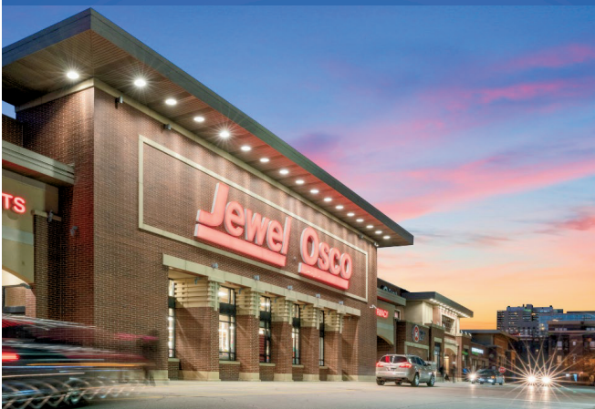
Old Town Square | Chicago, IL