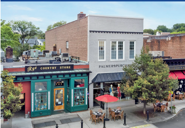
Purchase Street | Rye, NY