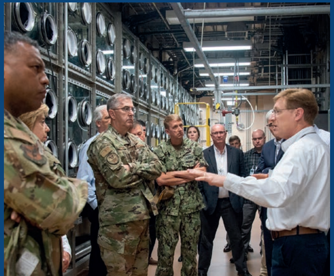
Savannah River Nuclear Solutions // Aiken, South Carolina, United States

This is Fluor... we are building a better world.