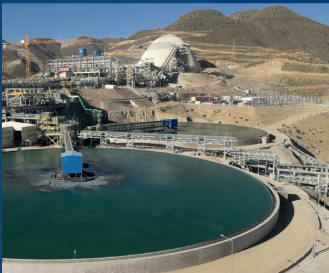
Quellaveco Copper Mine // Moquegua, Peru