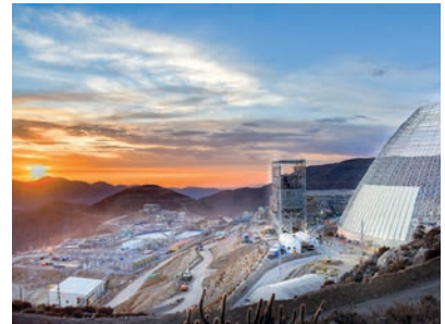
Quellaveco Copper Mine // Moquegua, Peru