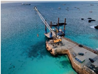
Auxiliary Airfield Repair Project // Ascension Island