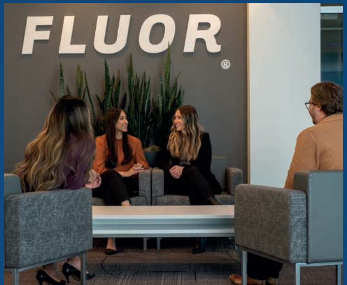
Fluor Calgary Office // Alberta, Canada