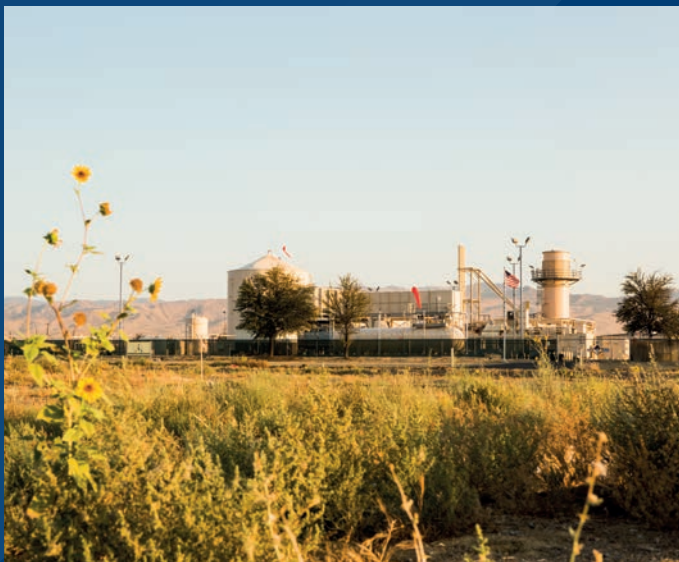
Chevron's Eastridge Cogeneration Facility // Kern County, California, United States.