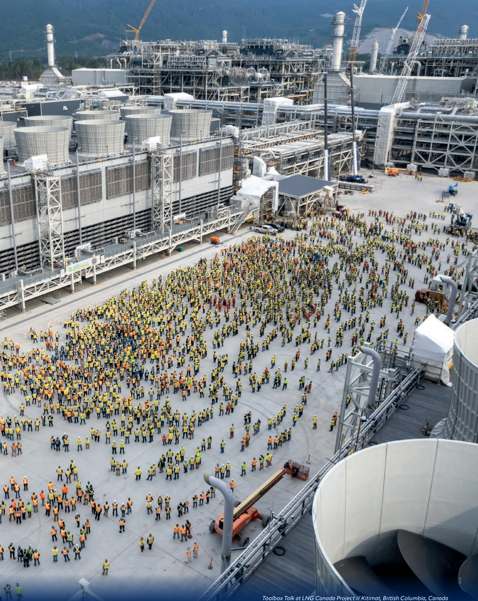
Toolbox Talk at LNG Canada Project // Kitimat, British Columbia, Canada