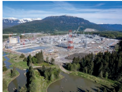
LNG Canada // Kitimat, British Columbia, Canada